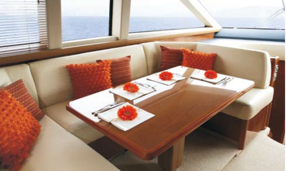
Helm • Galley • Dinette