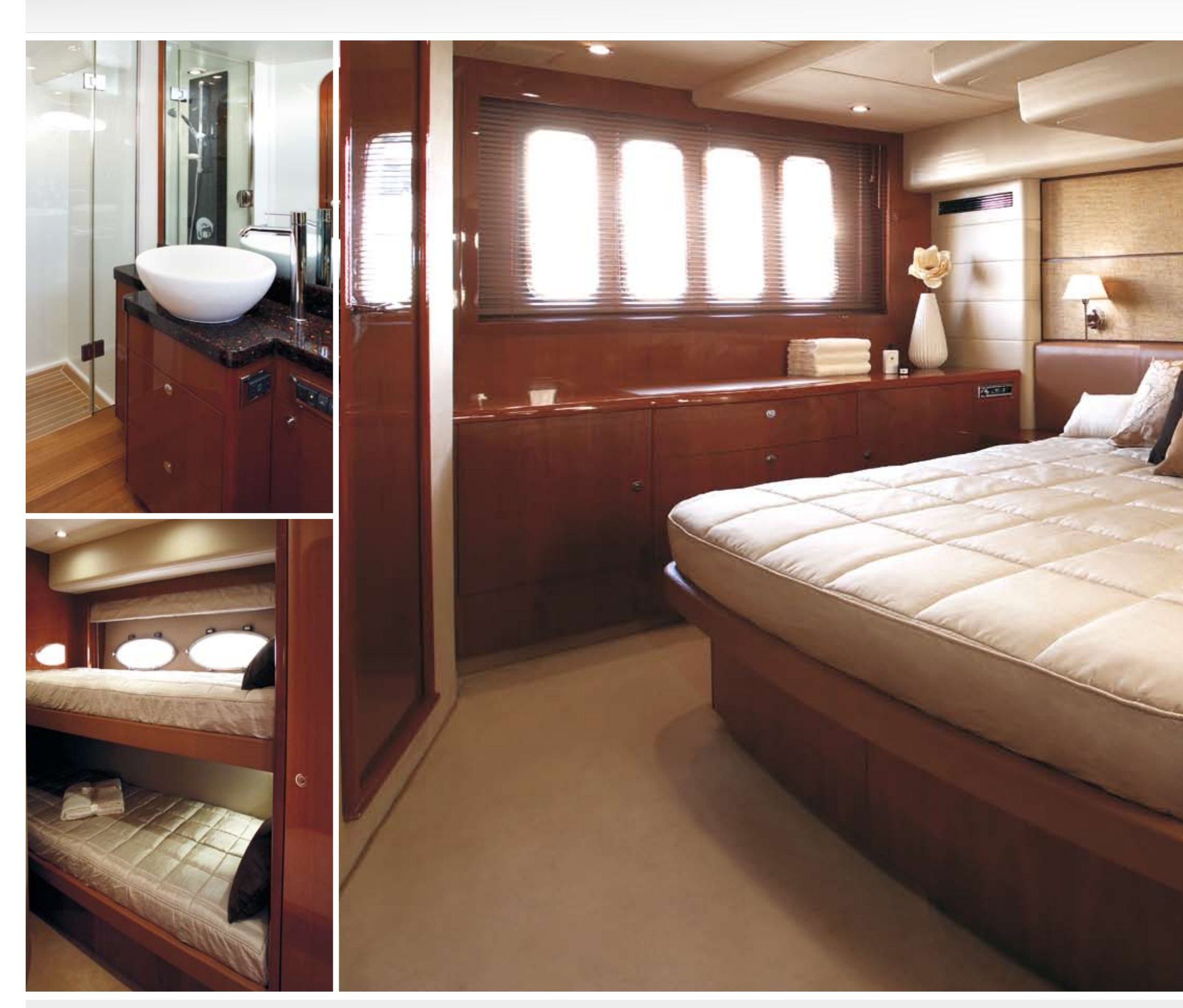
Owner's Stateroom Bathroom • Port Guest Cabin • Owner's Stateroom