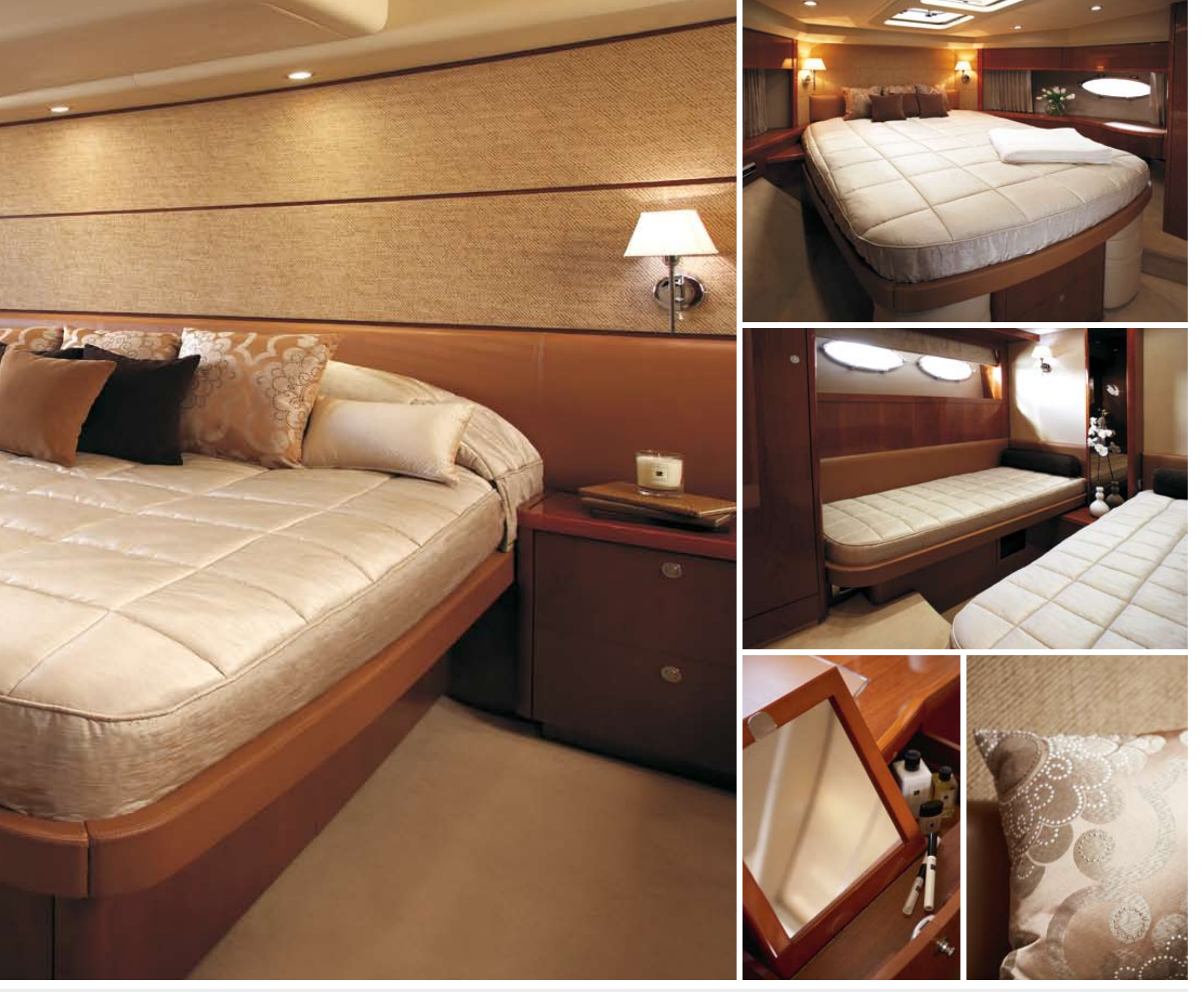
Forward Guest Stateroom • Starboard Guest Cabin