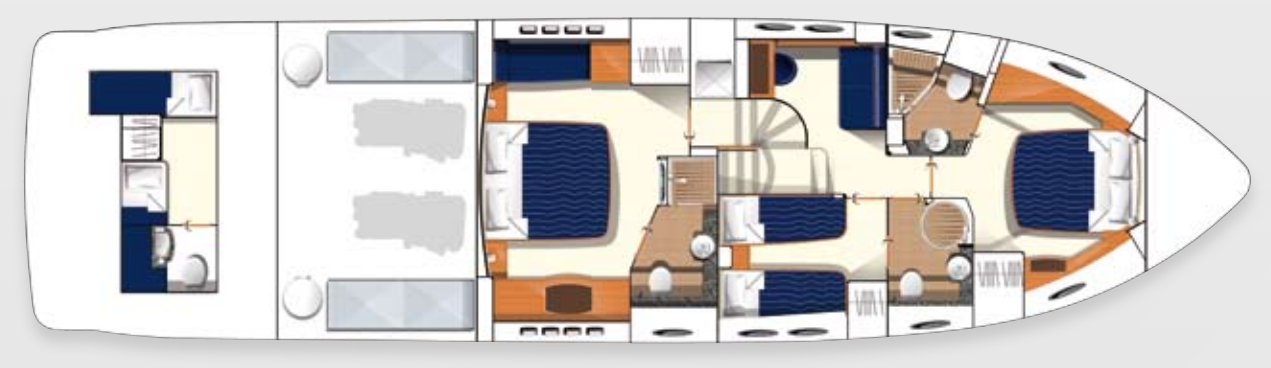
Lower accommodation layout with optional study (in place of port guest cabin)