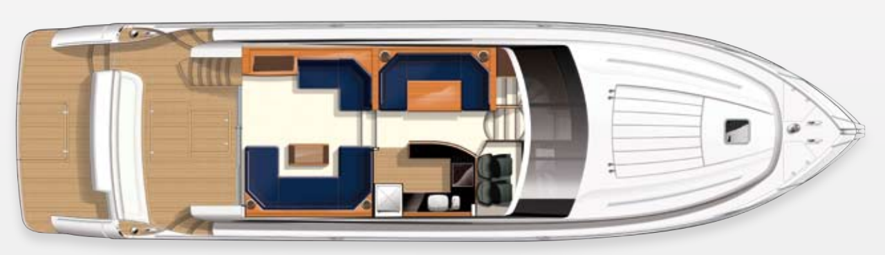
Upper accommodation layout